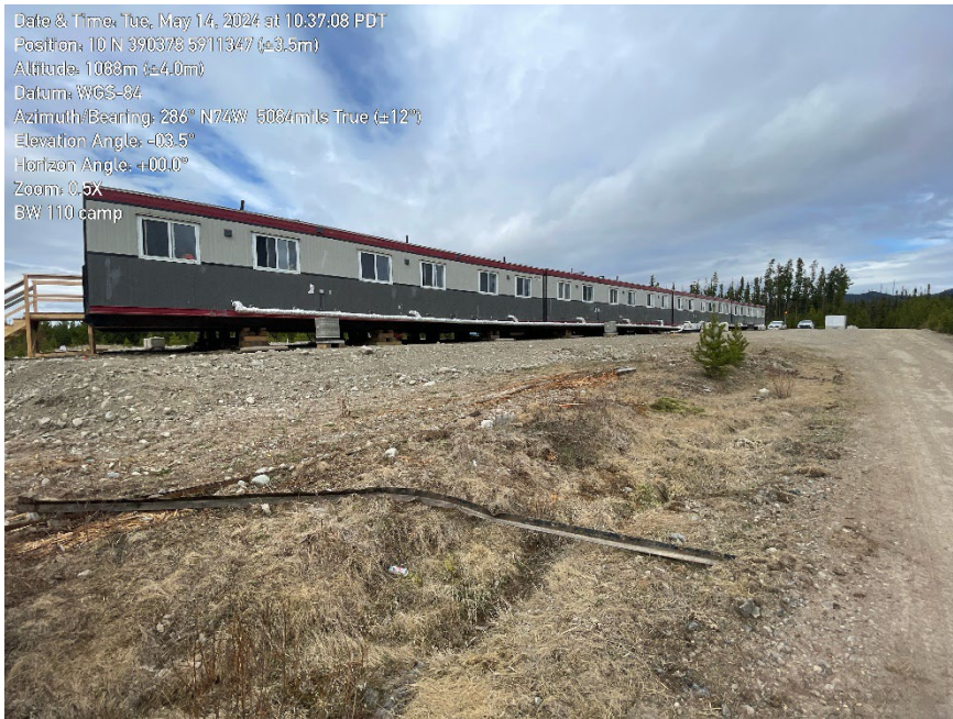
Photo 1. Camp, East side of main wing.

CPD Section 2.7 does not list camps as infrastructure that may be included in the ETL ROW.