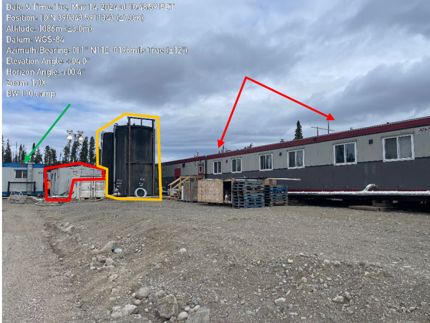
Photo 2. Camp, west side main wing (red arrows), south side smaller wing (green arrow), two generators (red polygon), potable water tanks (yellow polygon).