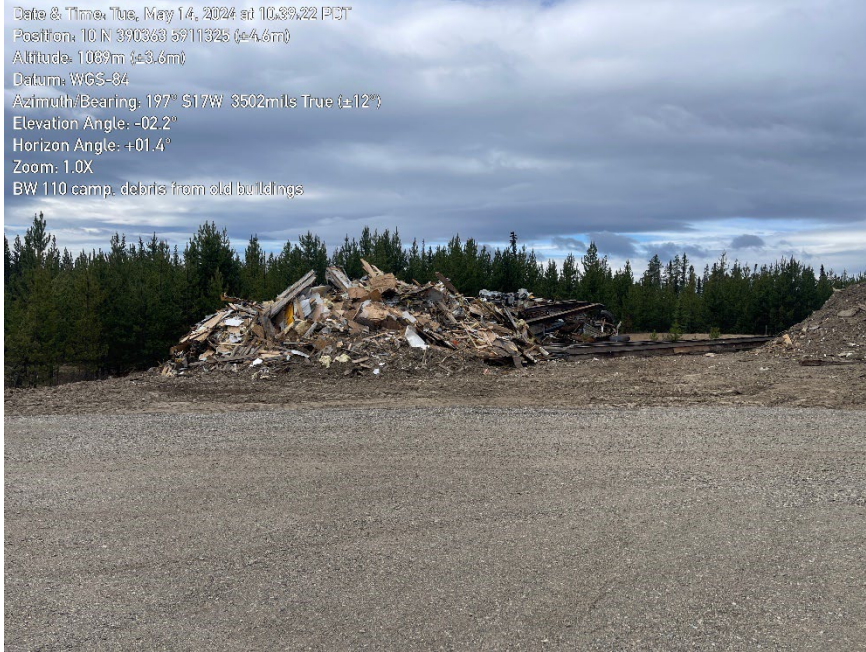
Photo 4. Chu Site, waste pile from the demolition of the original camp buildings.

Section 6(2) of the Act requires that Project facilities be constructed in accordance with the Certificate, despite approvals received under any other enactment. The Certificate authorizes one temporary construction camp and one operations camp to be constructed at the Mine Site as identified in the CPD. The camp constructed at the Chu site is not authorized by the Certificate. The information documented in this record confirms that the Certificate Holder is not compliant with section 6(2) of the Act because they constructed a camp facility that is not authorized by the Certificate.